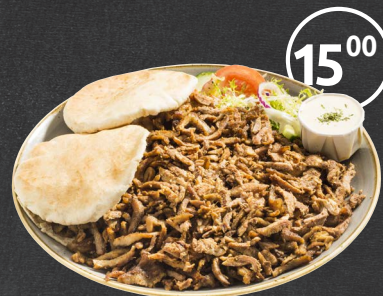
Shawarma speciaal with mushrooms, paprika and onion