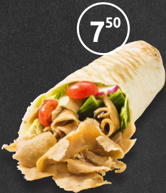
Döner or chicken durum