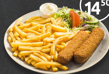
Kapsalon chicken or döner