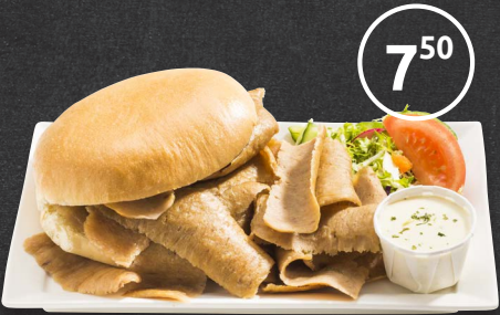
Döner or chicken sandwich